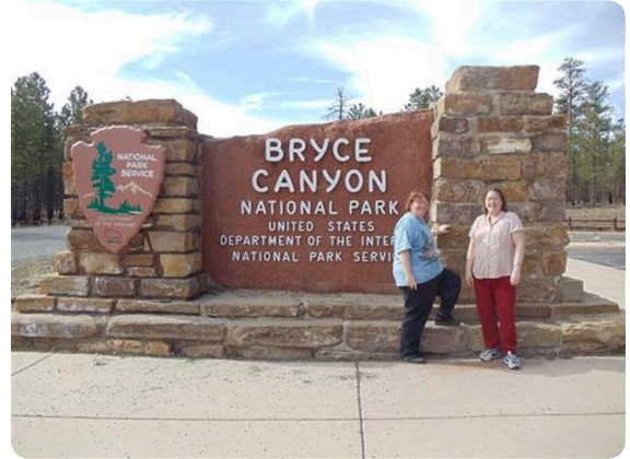
Together at Bryce Canyon